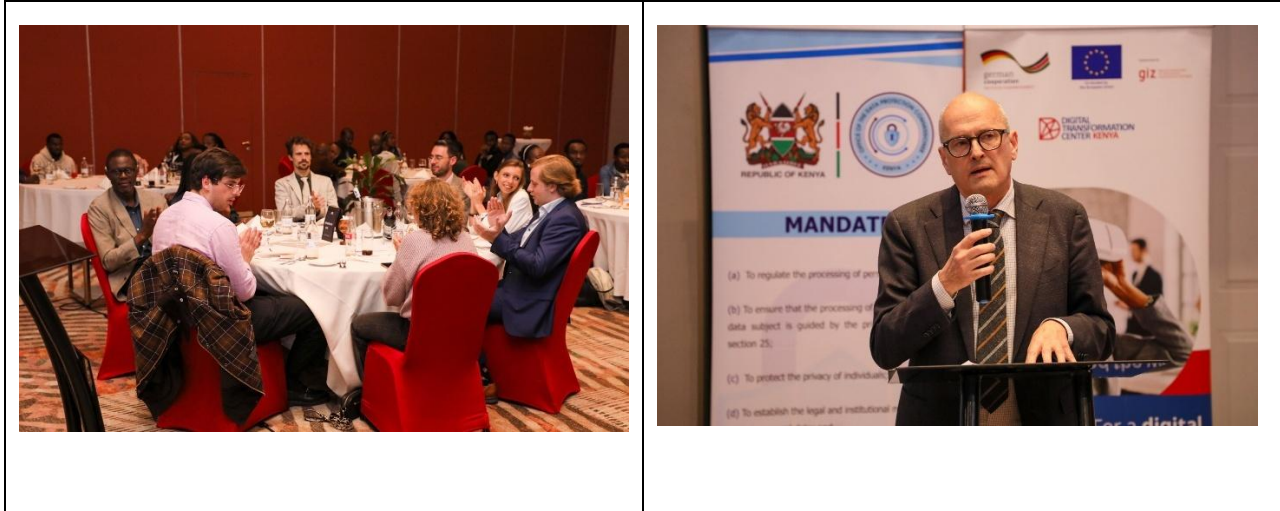
Photos of the last workshop and closing dinner in Kenya

ODPC is clearly a data protection leader in the region and has, as such, also a lot to offer to the region. At the same time, ODPC staff expressed their interest in and need for more training or likewise twinning projects to further strengthen their capacity and emphasized the wish for continued cooperation between BE DPA and ODPC.