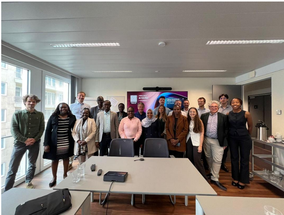
A photo of the delegates and the BE DPA staff at the BE DPA premises after a successful full day engagement.