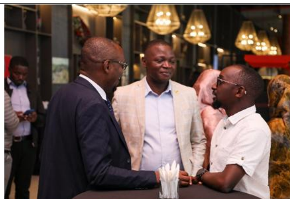
Delegates networking and exchanging during the breaks.