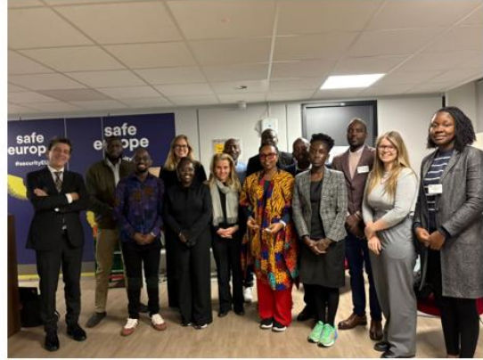
ODPC, GIZ and DG Just Representatives