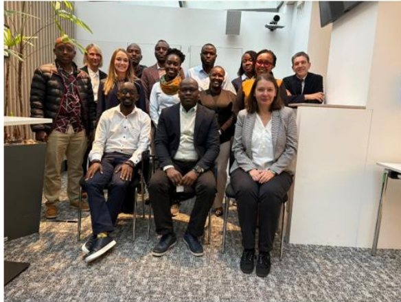
ODPC, GIZ, EDPB and EDPS Representatives