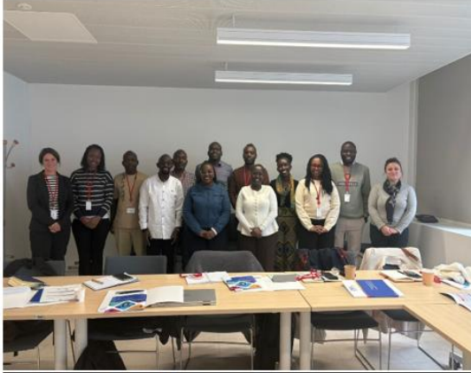
The delegation at CNIL premises