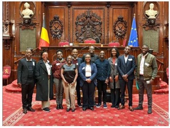
Delegates at the Belgium Parliament