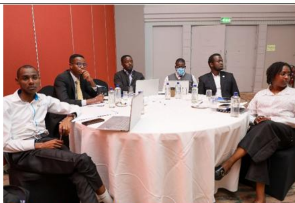
Delegates attentively listening to the ongoing presentations.