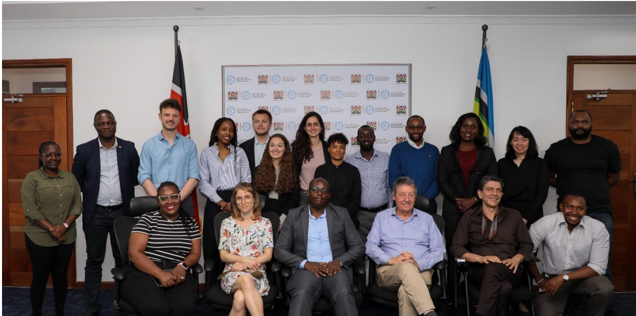
The Belgian DPA delegates and the ODPC staff at the ODPC premises during the first workshop in Kenya.

Through structured exchanges, study visits, ad hoc advisories, and joint workshops, the project supported ODPC in advancing its mandate under the Data Protection Act, 2019. The twinning partnership facilitated peer learning, comparative analysis of regulatory approaches, and practical exposure to European Union data governance frameworks.